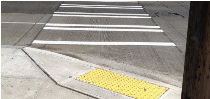
New or upgraded curb ramps at some intersections along N 80th St.