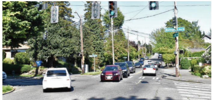
Repaving N 80th St to create a smoother drive for people accessing I-5 and Aurora Ave N.